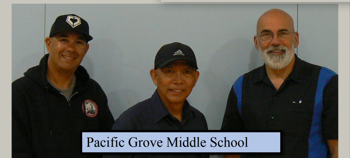
Pacific Grove Middle School