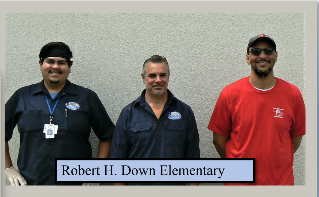
Robert H. Down Elementary