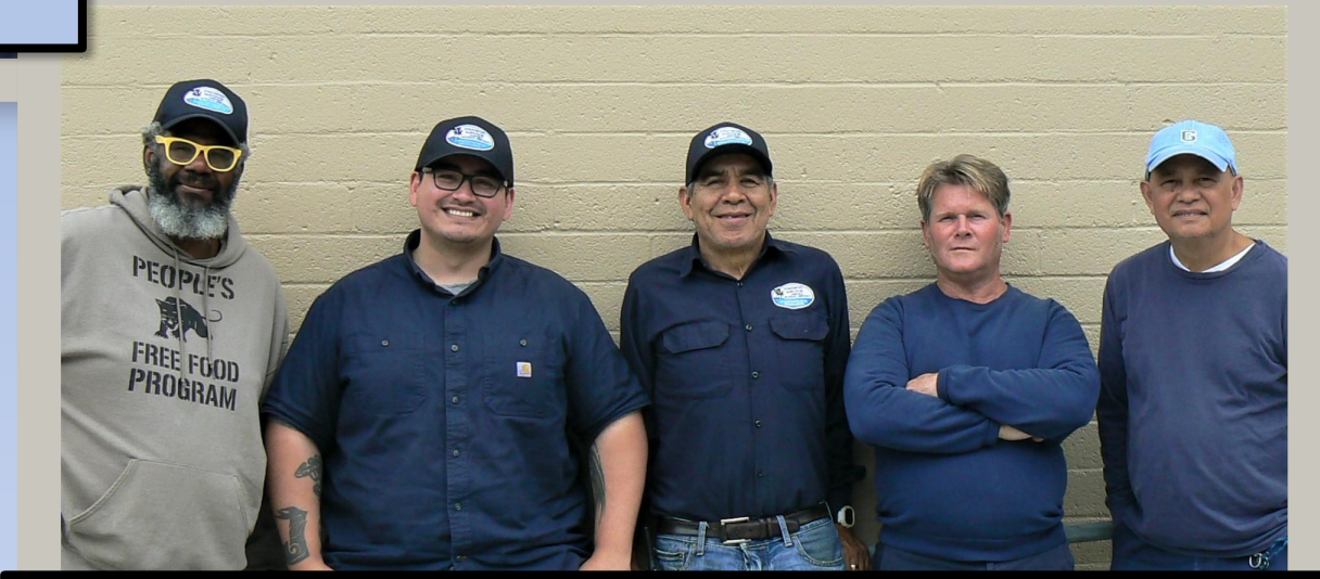
Pacific Grove High School & Community High School