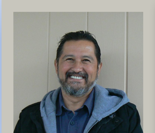
Forest Grove Elementary